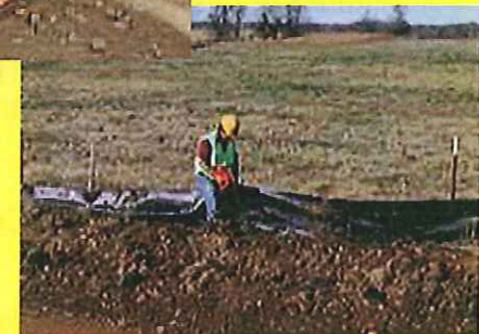
Stark County, Ohio