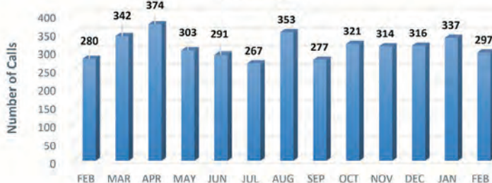
Total Calls by Month for a 12-month period (2023-2024)

As you can see from the graph, your Fire Dept. is a busy one. The graph shows our call volume by month for a 12-month period, representing our total number of calls, which includes both EMS as well as all others.